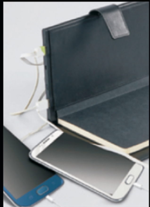
Charge Two Devices at a time.