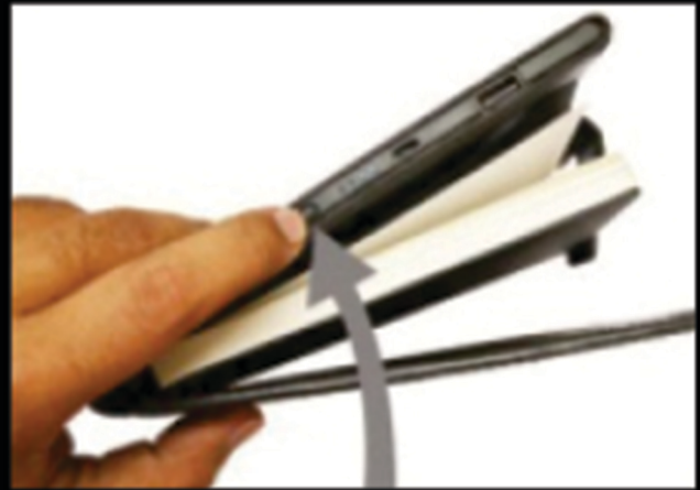
On / Off Switch.