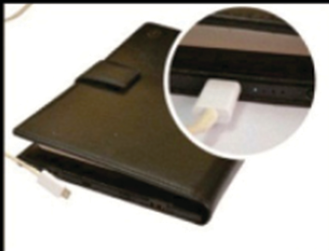
Put the USB cable in to the Power Bank for charging. The light will indicate the charging Percentage of the battery.