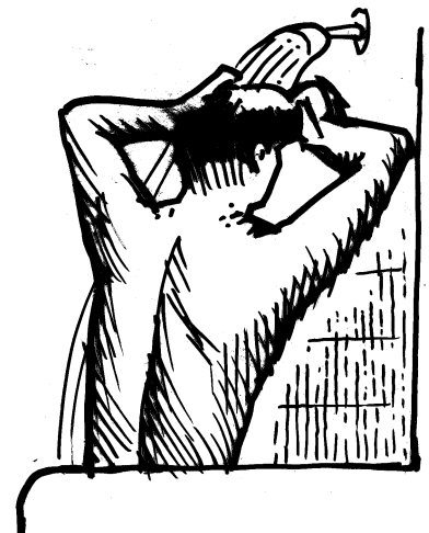
Thoroughly shower and shampoo your hair at the end of the day if you've worked in a pesticide-treated area.