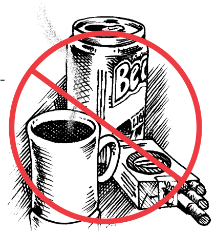
Avoid alcohol, cigarettes and coffee in cold outdoor weather.