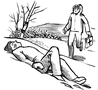
Serious cold-related injuries such as hypothermia need immediate medical attention.