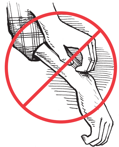
Avoid scratching insect bites.