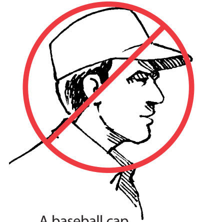
A baseball cap alone won't adequately protect you from the sun.

Warning: A baseball cap alone won't adequately protect you from the sun. If you do wear a baseball cap, wear it with a neck shade. Or look for a baseball-style cap that has a protective sun flap. This will help protect the back of your neck and your ears as well as your face.