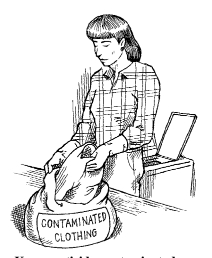
Keep pesticide-contaminated clothing separate from other clothing.

Note to trainer: Take time to answer trainees' questions. Then review the Pesticide Cleanup Do's and Don'ts.