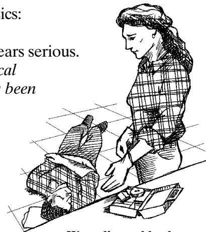
Wear disposable gloves when administering first aid.