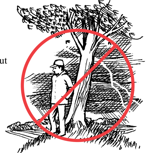
Don't stand under an isolated tall tree.

Note to trainer: Take time to answer trainees' questions. Then review the Severe Weather Do's and Don'ts.