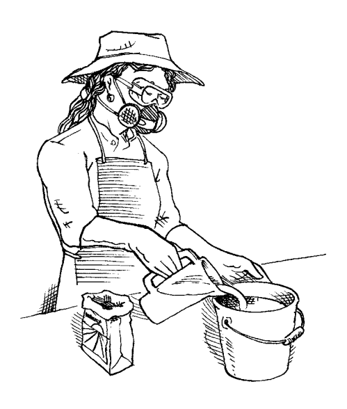
(Continued on back)

See our <u>full line of safety supplies</u>, including respirators, eye and ear protection, coveralls, first aid and more.