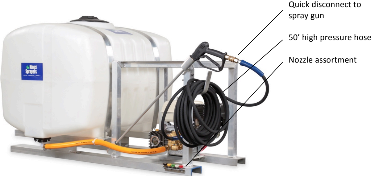
Figure 1: Side View

Quick disconnect for easy nozzle replacement