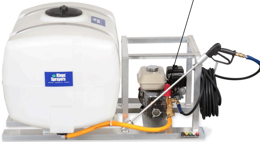
Figure 4: Side View

Regulator – Screw “in” to increase pressure, screw “out” to decrease pressure