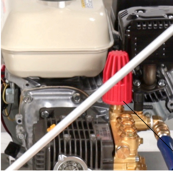
Figure 3: Detailed View

Regulator – Screw “in” to increase pressure, screw “out” to decrease pressure