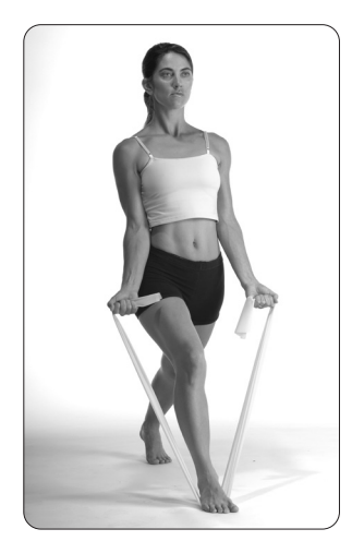
STEP TWO - While keeping your elbows locked against your waist, slowly curl the band to your shoulders. Slowly lower back to the starting position. Repeat.

STEP ONE - Stand with one foot on the center of the Flat Band with your other foot off of the band to rear.