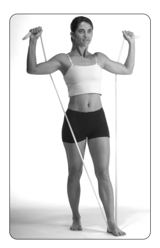
STEP TWO - Push off with your back leg to starting position and repeat. Alternate legs as desired. Repeat.

STEP ONE - Stand on the center of the Flat Band with one foot to the front. Place your other foot behind at shoulder width. Hold the band at face level with elbows out and parallel to shoulders.