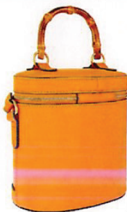
Sierra bucket bag, £27.50, uk.accessorize.com