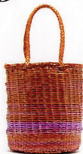
Dragon Diffusion woven-leather bucket bag, £270, matchesfashion.com