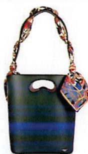
Sophia leather bucket bag with customisable silk scarf, £650, libertylondon.com