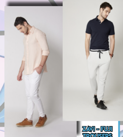
ZAVI - FUJI TROUSERS (LEFT) - £80 |

KAPPA OFFER A GREAT RANGE OF COMFORT CLOTHES, WHILST ALSO PROVIDING TANKS AND CARDIGANS TO DRESS THE LOOKS UP A BIT MORE