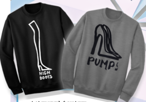
AGNE KUZMICKAITE - SWEATERS - 109.95€

KEEP YOUR WATER, FACE MASK, SANI-GEL AND ANY OTHER ESSENTIALS SAFE IN STYLE WITH THIS PACK