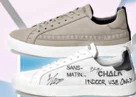
SANS MATIN - VARIETY OF STYLES FROM £140

KEEP YOURSELF CALM AND COLLECTED IN THIS COMFORTABLE HALF ZIP SWEAT, PERFECT FOR THE EVENING CHILLS