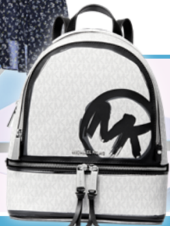
MICHAEL MICHAEL KORS - RHEA MINI BACKPACK - £210

KEEP YOUR WATER, FACE MASK, SANI-GEL AND ANY OTHER ESSENTIALS SAFE IN STYLE WITH THIS PACK