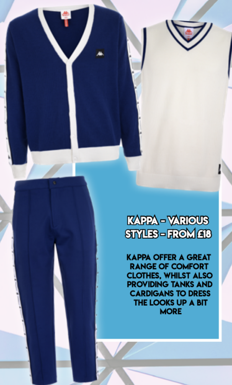
KAPPA - VARIOUS STYLES - FROM £18

KAPPA OFFER A GREAT RANGE OF COMFORT CLOTHES, WHILST ALSO PROVIDING TANKS AND CARDIGANS TO DRESS THE LOOKS UP A BIT MORE