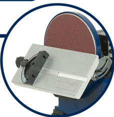
Table tilts from 0° to 45° Comes with miter gauge