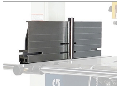
6" FENCE WITH RESAW BAR