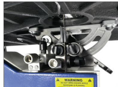
LOWER BEARING AND TRUNNION ASSEMBLIES