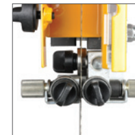
TOOL-LESS BLADE GUIDE ADJUSTING