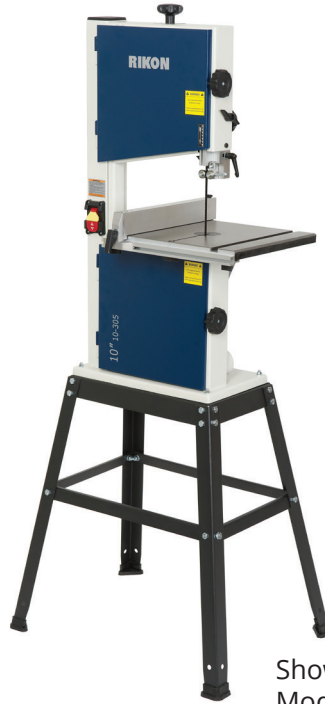
Shown with optional stand Model 13-913