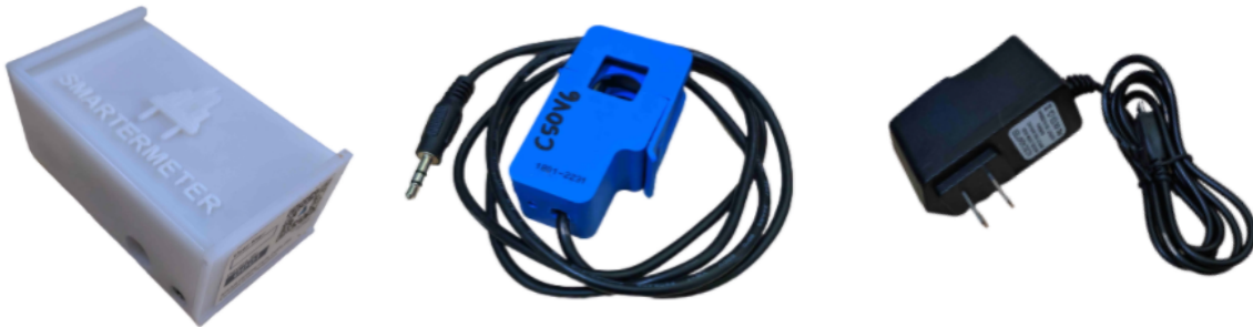
From left to right: SmarterMeter Unit, Clamp Current Sensor, Power Supply.