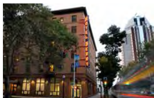
The Studios at Hotel Berry Sacramento, CA

Since 2003, our strategy has been to ensure that people are housed first. Jamboree often uses a coordinated entry method to house those most vulnerable. Stable housing is the foundation on which stable lives are built.