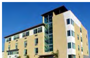
Jackson Aisle Midway City, CA

INTEGRATED , mixed-use renovation and modernization of 1920s vintage hotel into 105 single-resident occupancy studios (includes 10 MHSA, 25 veterans) with first-floor retail space, just blocks from State Capitol