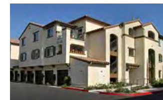
Doria Irvine, CA

DEDICATED development of 25 apartment homes as State's first 100% MHSA property