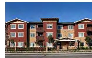
Diamond Anaheim, CA

INTEGRATED community of 70 apartment homes (includes 6 large families, 15 MHSA, 48 homeless families) built by Jamboree's in-house licensed GC