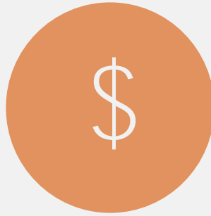
High cost of Land