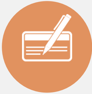
Lack of Financing