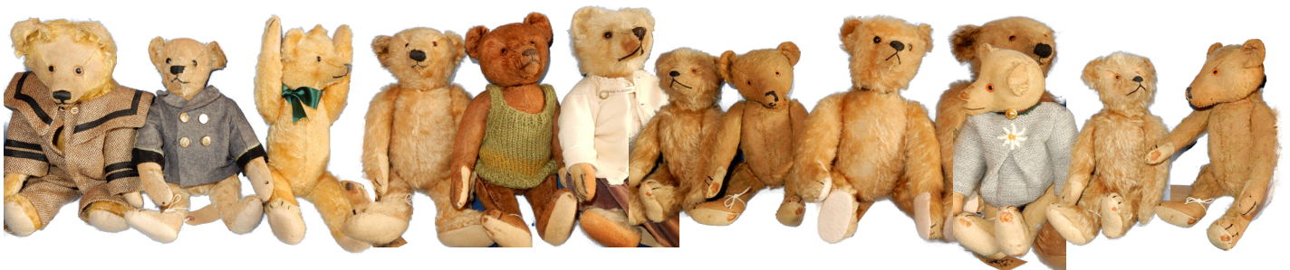
IMAGE ON NEXT PAGE

Wonderful rare antique, German Gebruder Bing teddy bear with his red tag on the arm of his coat. Measuring 8" from skates to tips of ears. Original small black boot button eyes. Nose and mouth stitching are original and horizontal. He has a magnificent mohair coat and a pronounced snout, small cupped ears and felt pads. Wonderful old bear, who is still sturdy and strong for his 100 years. He has two similar family members