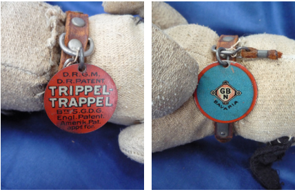
ABOVE: Trippe Trappel Tags.