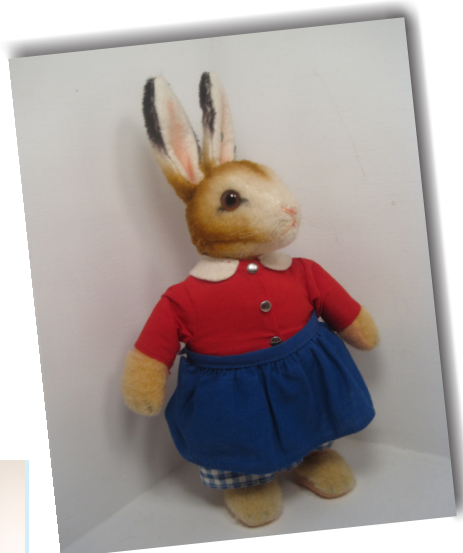
ABOVE: Vintage Steiff Girl Rabbit Doll