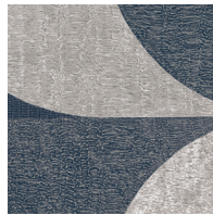
LX1888 Steel Blue