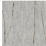
LX1723 Soft Silver