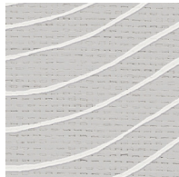
LX1701 Soft Silver