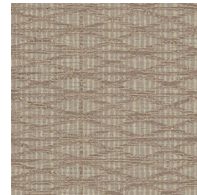
LX1560 Soft Silver