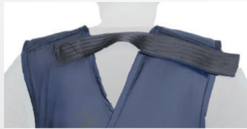
Closure A – Velcro flap between the shoulders