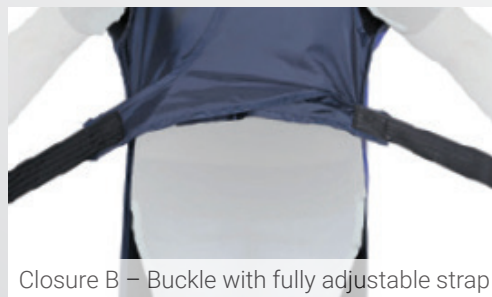
Closure B – Buckle with fully adjustable strap