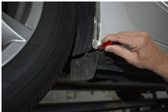
(3) REMOVE METAL CLIP