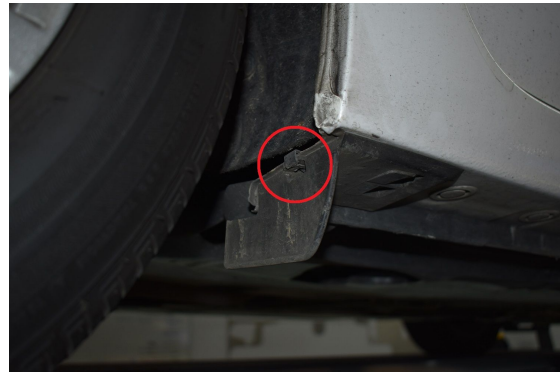
(2) METAL CLIP