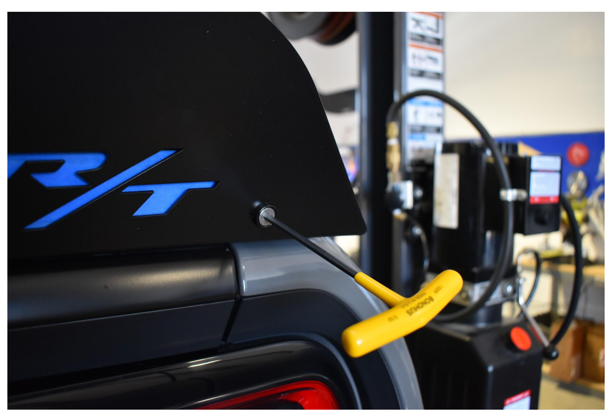
7.) Mark the remaining holes through the wicker bill and onto the OEM spoiler - a total of 6.