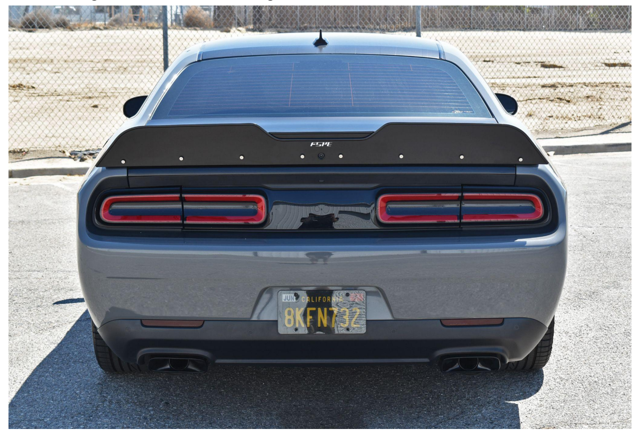
11.) YOU ARE DONE!!! If you have any questions feel free to contact us and we'll be happy to answer any questions you might have. ENJOY!

10.) Install your wicker bill with the 2nd layer sitting toward the front of the car. The 2nd layer has common bolt holes with the wicker bill. Use the provided ½"-20 hardware and countersunk washers. Snug each bolt & do not over tighten.