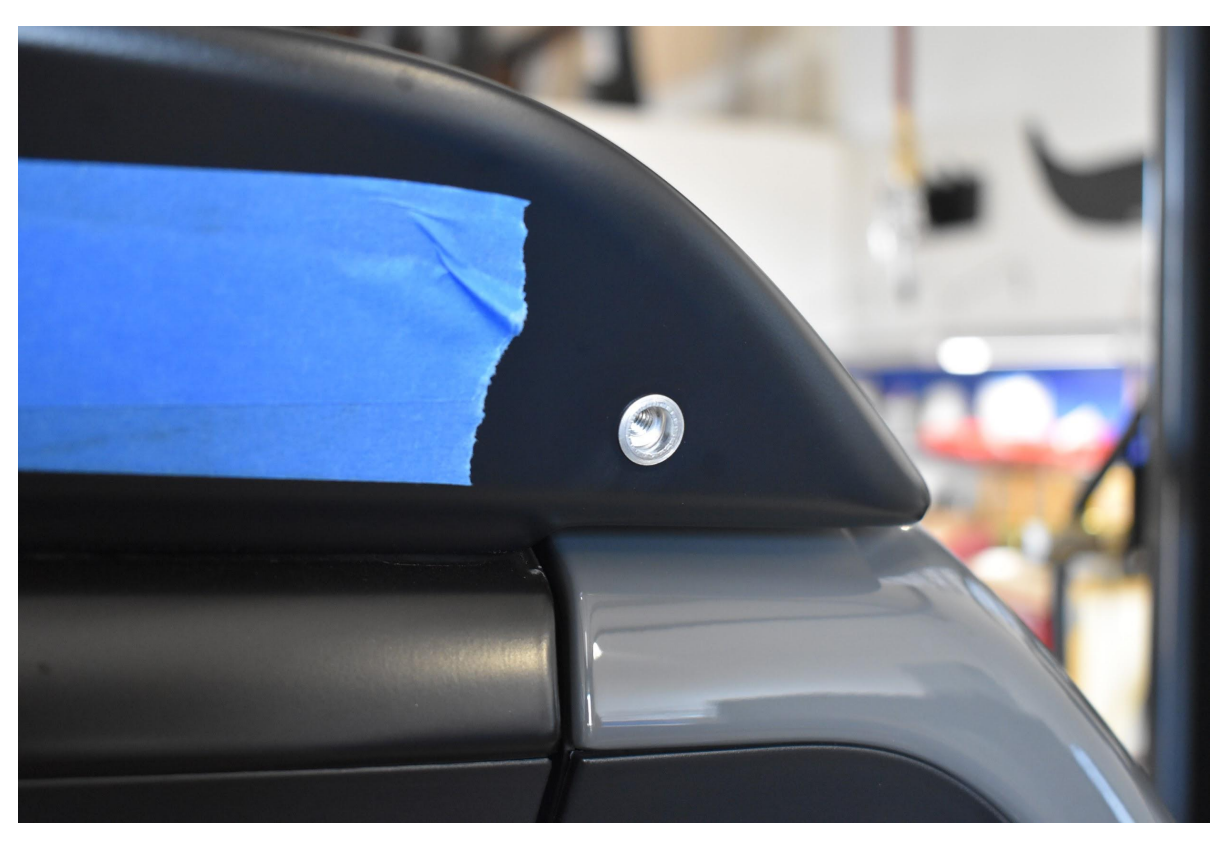
6.) Attach your wickerbill to the OEM spoiler using the supplied bolts and washers. No need to over tighten.