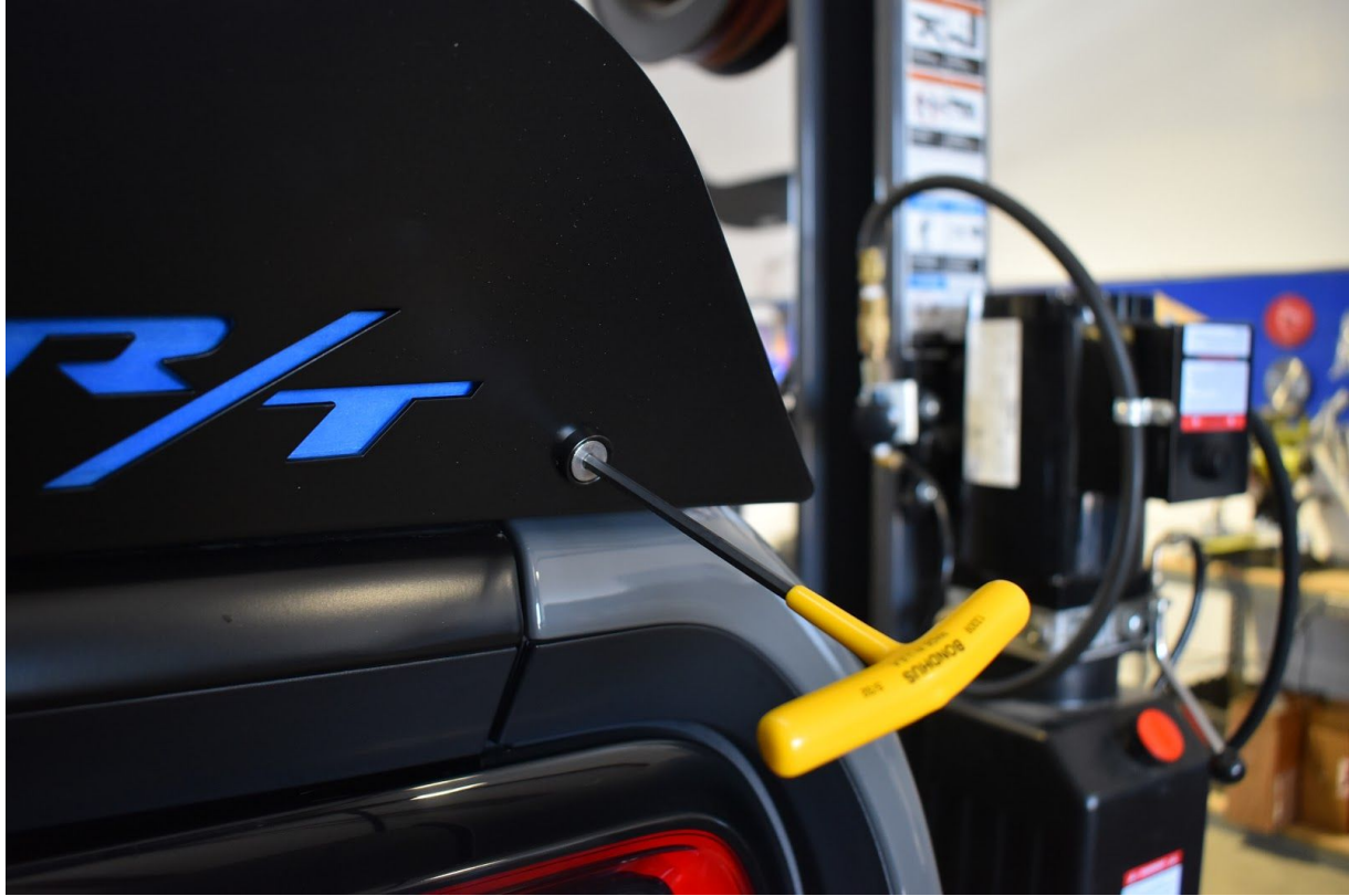
7.) Mark the remaining holes through the wicker bill and onto the OEM spoiler - a total of 6.