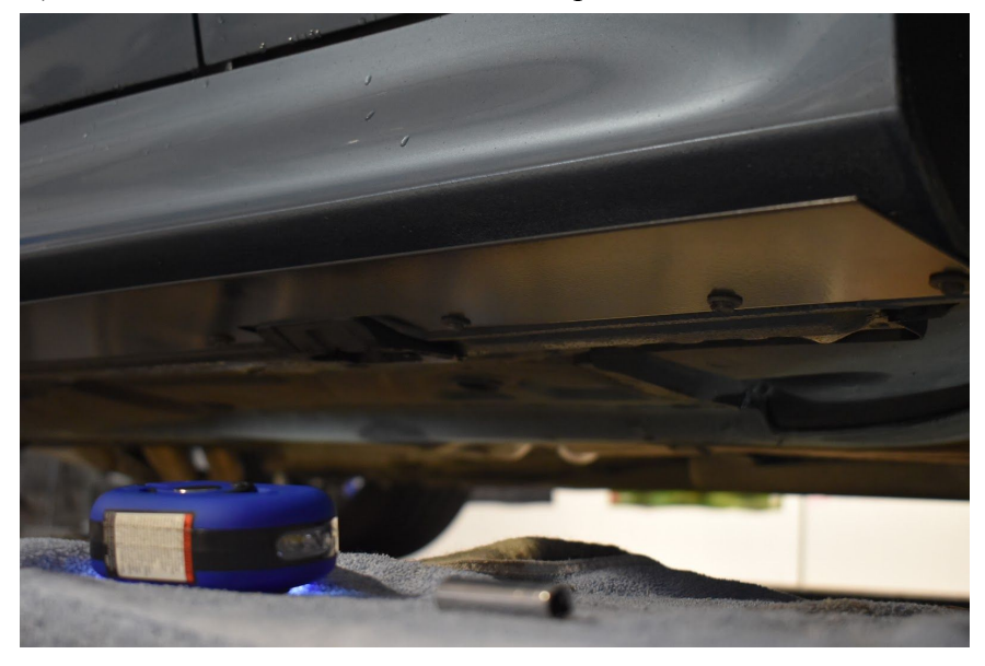
7.) Enjoy your new FS Performance Engineering aero! Tag us & use #FSPerformanceEngineering in the online world!!

6.) Make sure all bolts are secure and repeat on the other side!