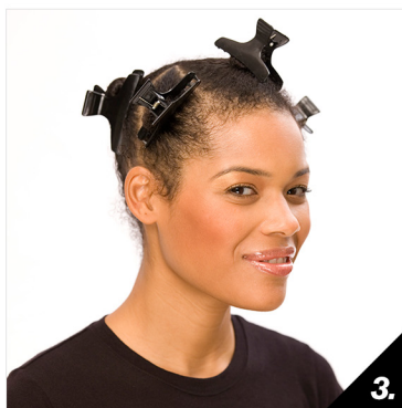
3. Section the hair with butterfly clips