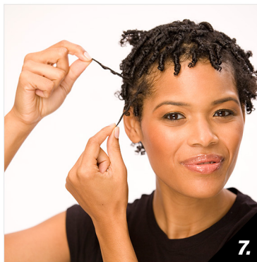
7. Unravel small coils to create fullness