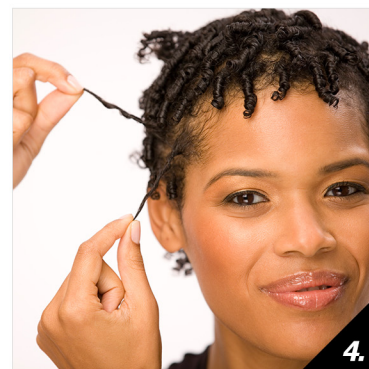
4. Coil small sections at a time.