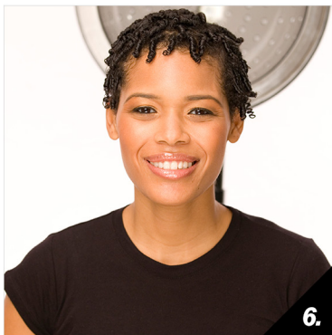
6. Fully dried