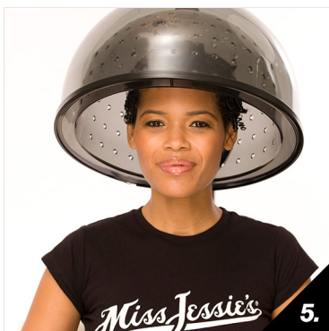
5. Sit under an overhead dryer for 30-45 mins.