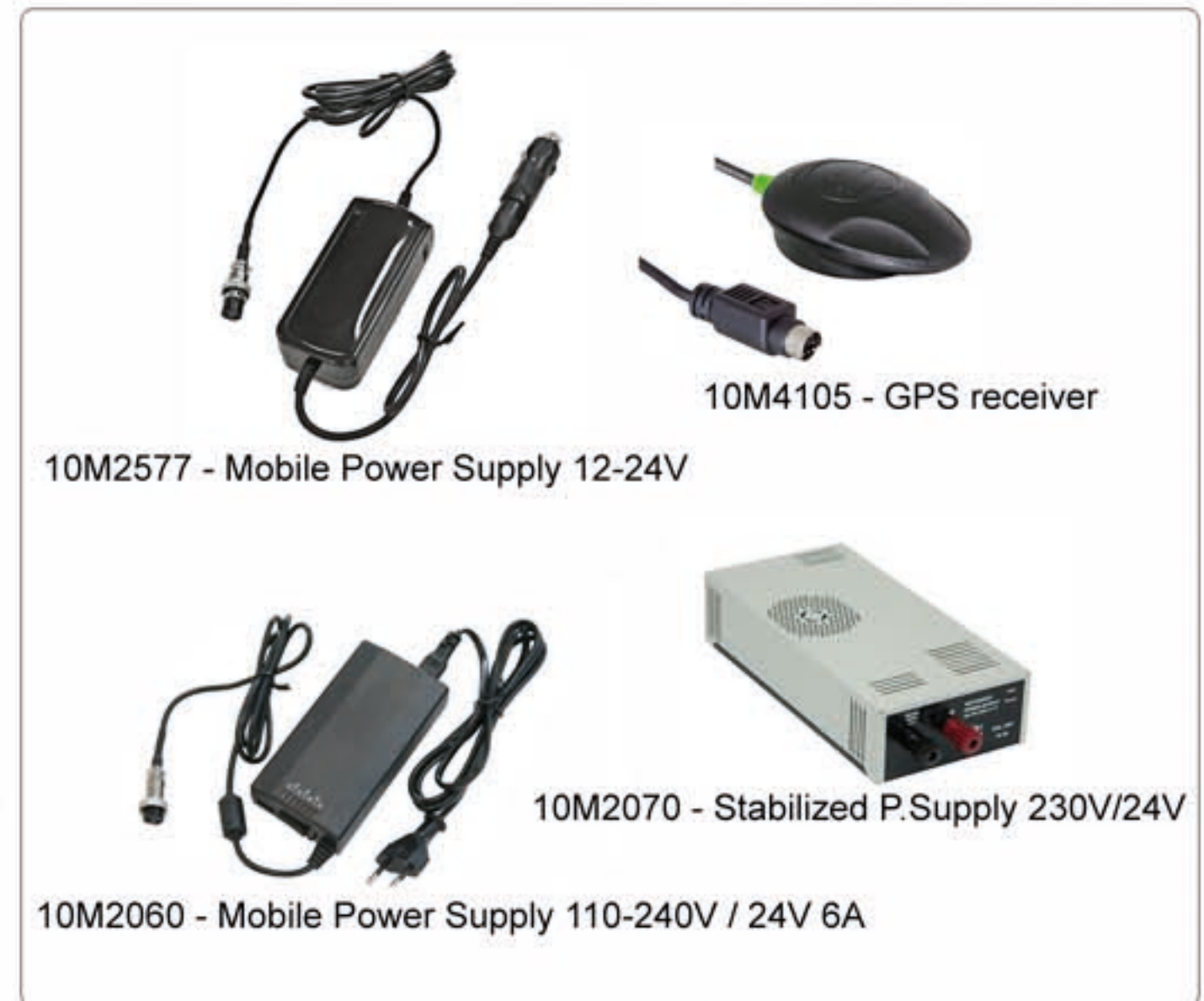
10M2577 - Mobile Power Supply 12-24V