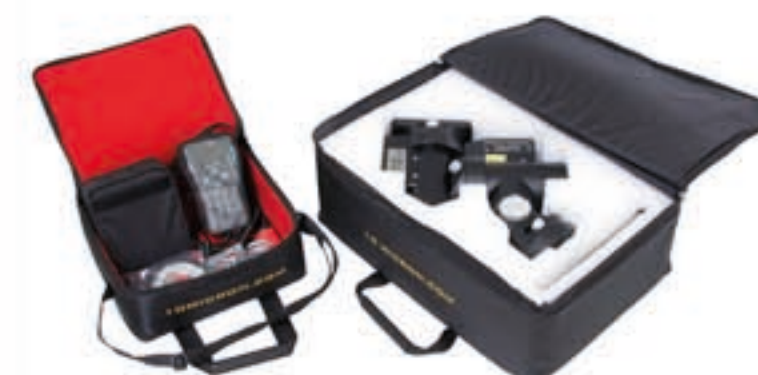
10M1068 - Double Carrying bag