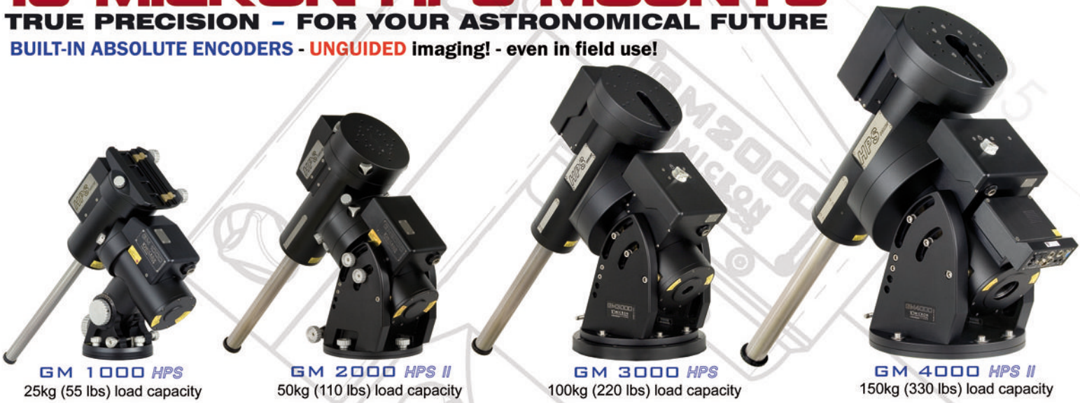
GM 1000 HPS

BUILT-IN ABSOLUTE ENCODERS - UNGUIDED imaging! - even in field use!