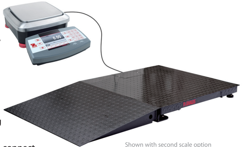
Shown with second scale option

With ten advanced application modes, including formulation, sieve analysis and density weighing, Ranger 7000 can meet the weighing and measurement needs of practically any industrial application or manufacturing process. Many application modes eliminate the need to do long and complicated manual calculations. Ranger 7000 contains a 2000 item library for storage of weighing, check, counting, and filling data and 30 item library for formulation and sieve analysis data, ensuring abundant space for all data storage needs.