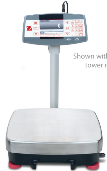
Shown with optional tower mount