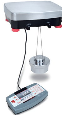
Weight below hook in use

Additionally, a weigh below hook offers the functionality to perform specific gravity tests or weigh items that cannot be easily placed on the weighing platform.