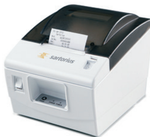
Plug & Play Standard printer YDP40

Two large, easy-to-adjust feet and an outstandingly simple-to-read level indicator on the front make it a breeze for you to level the Practum®. This helps ensure accurate, repeatable weighing results.