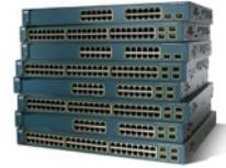
Switch, Routing & PBX