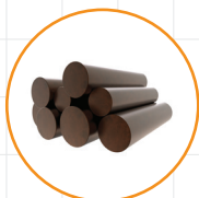
Decorative Steel Logs