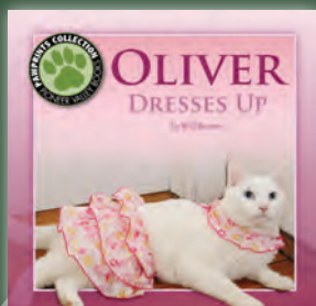
TITLE: OLIVER DRESSES UP LEVEL: B