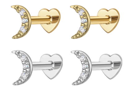
2 x 14k solid crystal moon flat back labret studs