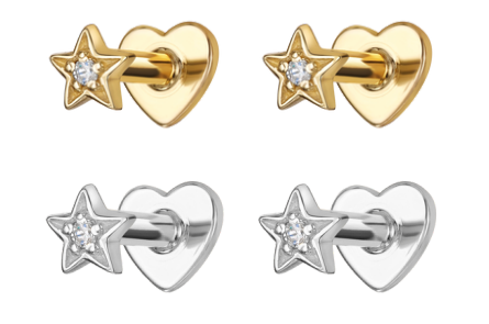
2 x 14k solid gold Nova star flat back labret studs