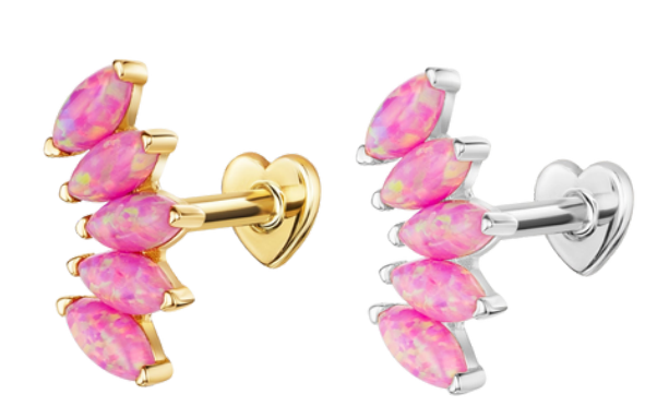
Flora pink opal tiara stud, £180