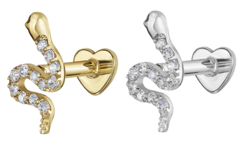
Sparkly snake stud, £140