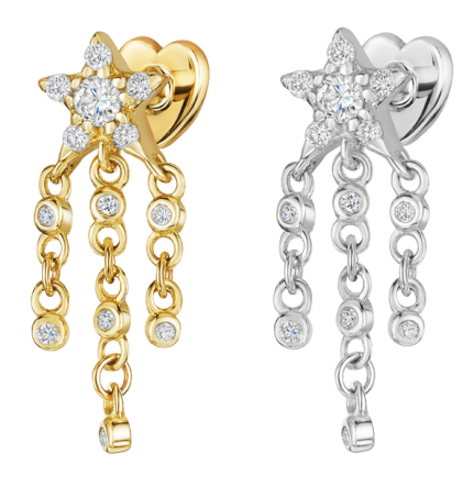
Shooting star stud, £200