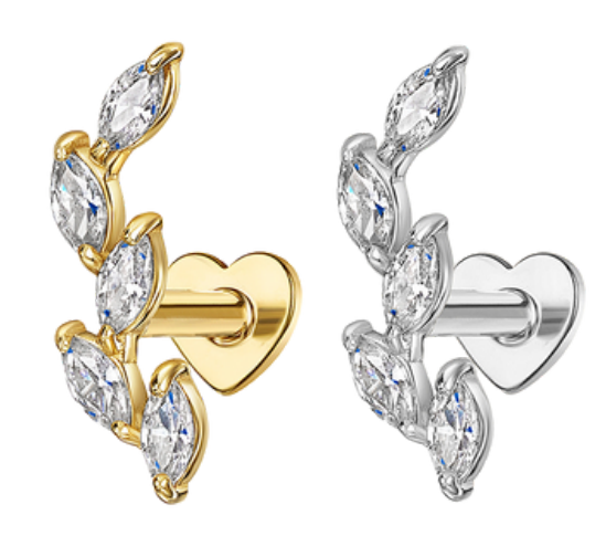
Willow stud, £160