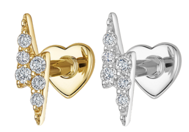
Lightning bolt stud, £120