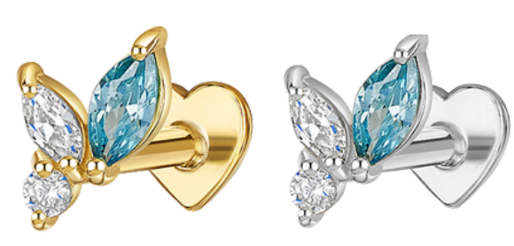
Hermia stud, £160