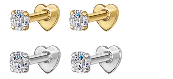
2 x 14k solid gold single crystal gem flat back labret studs