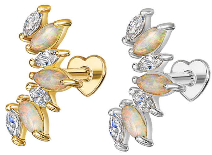
Titania's Crown stud, £220