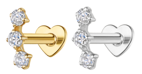
Trinity crystal stud, £140