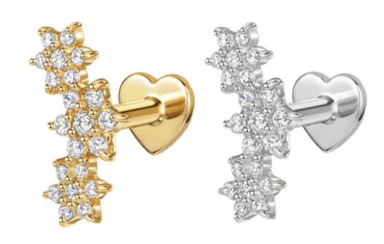
Daisy chain climber stud, £170