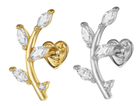
Vine garland stud, £170