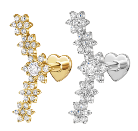
Flower crown climber stud, £250