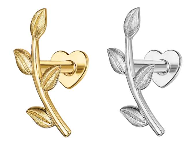
Textured vine garland stud, £170