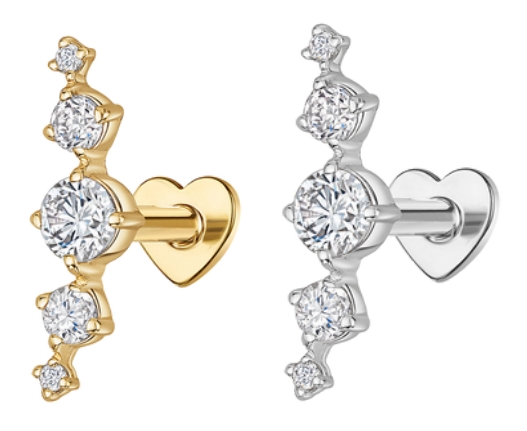
Astraea stud, £180