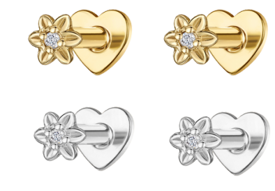
2 x 14k solid 'Forget Me Not' tiny flower flat back labret studs