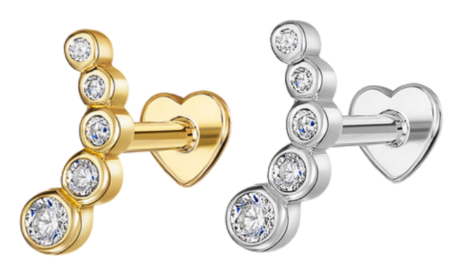
Large summer rain climber stud, £190