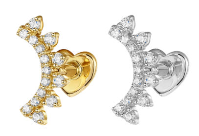
Tala stud, £160