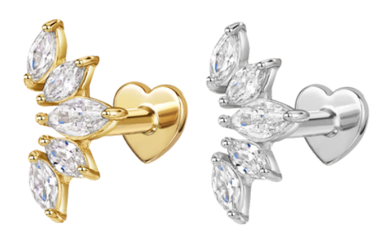
Tiara stud, £170