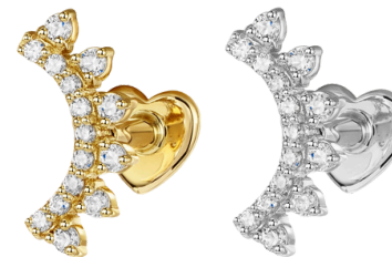
Tala stud, £160