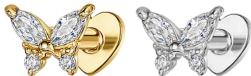
Tiny butterfly stud, £140