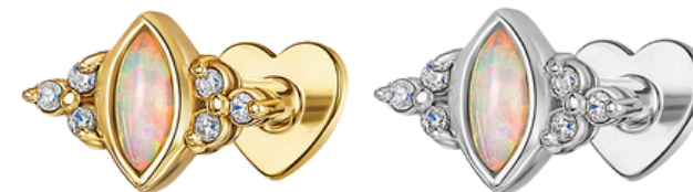
Opal Hera stud, £180