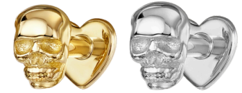
Skull stud, £150