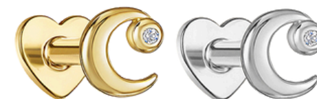
Moonbeam stud, £120