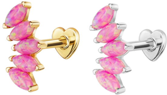
Flora pink opal tiara stud, £180

All available in 14k solid yellow or white gold