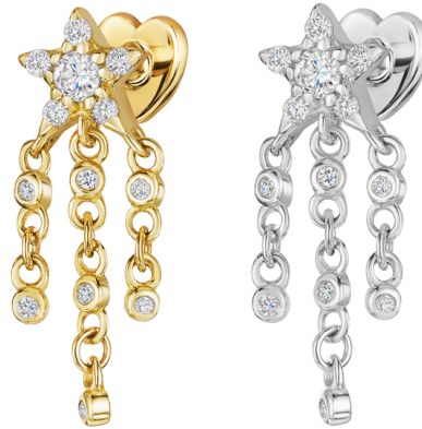
Shooting star stud, £200