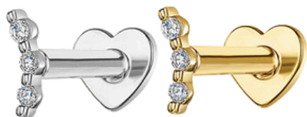
Tiny pixie stud, £130