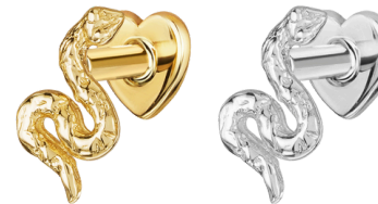
Tiny textured serpent stud, £130