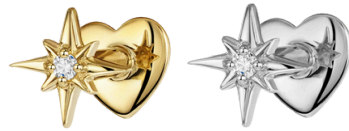
North Star stud, £130