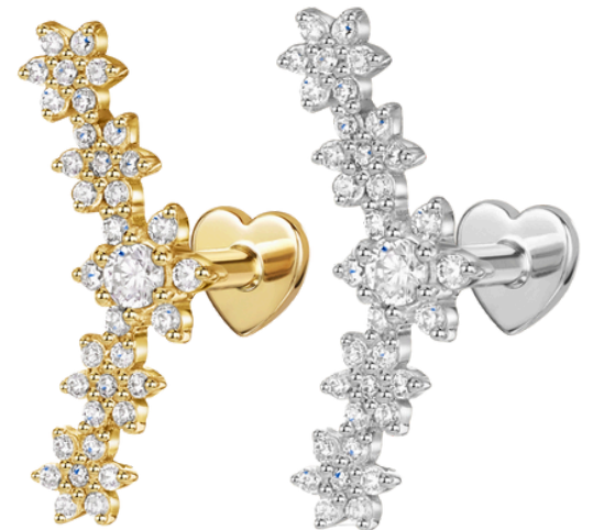
Flower crown climber stud, £250