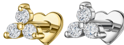
Crystal trio stud, £130