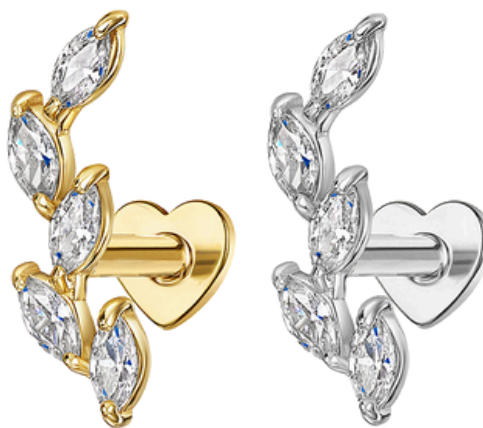
Willow stud, £160