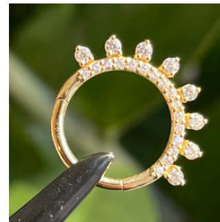
Frida crystal pavé clicker hoop, £250