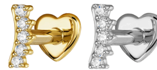
Curved gem stud, £130