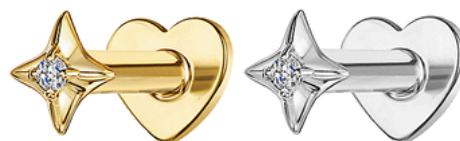
Tiny twinkle stud, £120