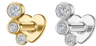
Dew Drop climber stud, £130