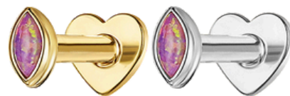
Tiny Flora pink opal marquise stud, £130