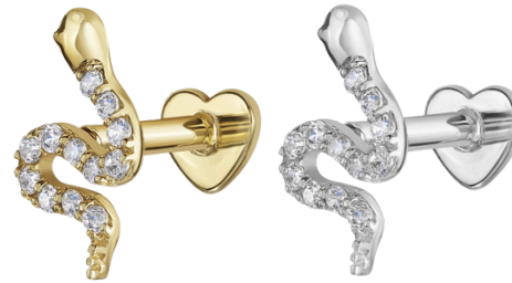
Sparkly snake stud, £140