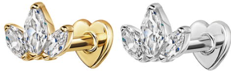
Lotus flower stud, £130

All available in 14k solid yellow or white gold