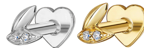
Fairy wing stud, £120