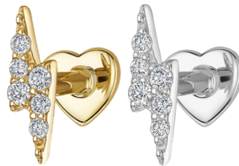
Lightning bolt stud, £120