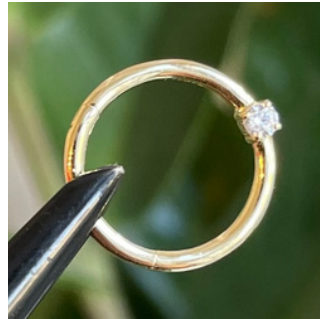
Single gem clicker hoop, £180