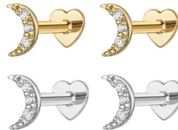
2 x 14k solid crystal moon flat back labret studs