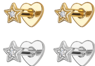
2 x 14k solid gold Nova star flat back labret studs