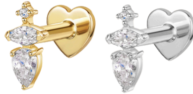
Elsa stud, £130