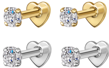
2 x 14k solid gold single crystal gem flat back labret studs

All available in 14k solid yellow or white gold