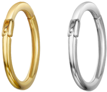
Plain clicker hoop, £150

All available in 14k solid yellow or white gold