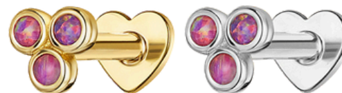
Pink opal triad stud, £140