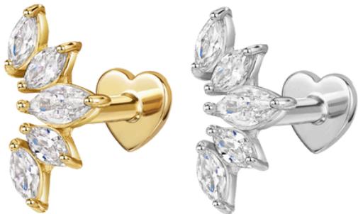
Tiara stud, £170