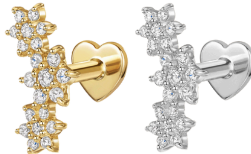
Daisy chain climber stud, £170