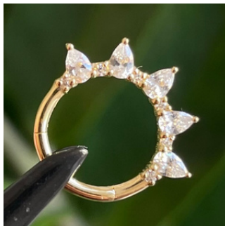
Dreamer pear cut clicker hoop, £240