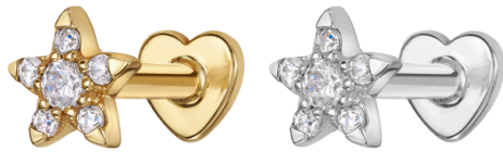
Crystal star stud, £140