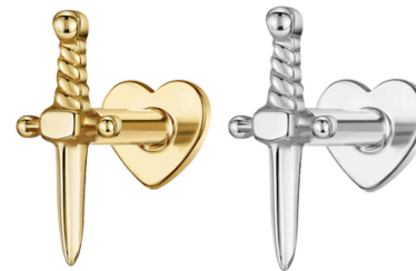
Juliet dagger stud, £120