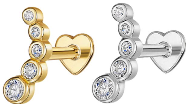
Large summer rain climber stud, £190

All available in 14k solid yellow or white gold