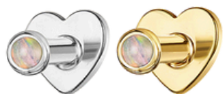
Tiny bezel opal stud, £110

All available in 14k solid yellow or white gold