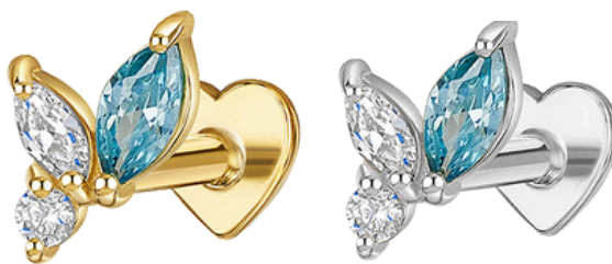
Hermia stud, £160