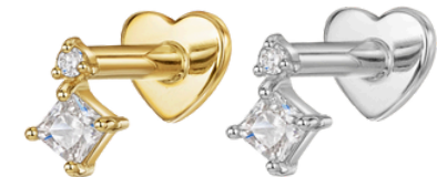
Tiny Stella stud, £110