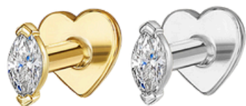
Tiny marquise stud, £120