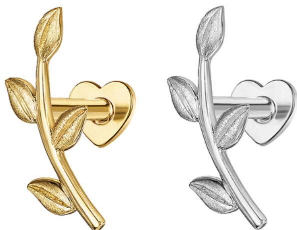
Textured vine garland stud, £170