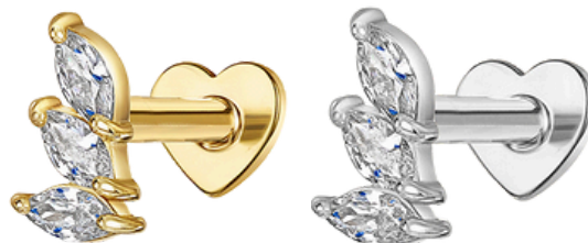
Enchanted marquise stud, £140