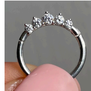
Tiara clicker hoop, £220