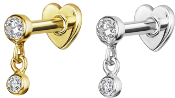
Hanging crystal gem stud, £120