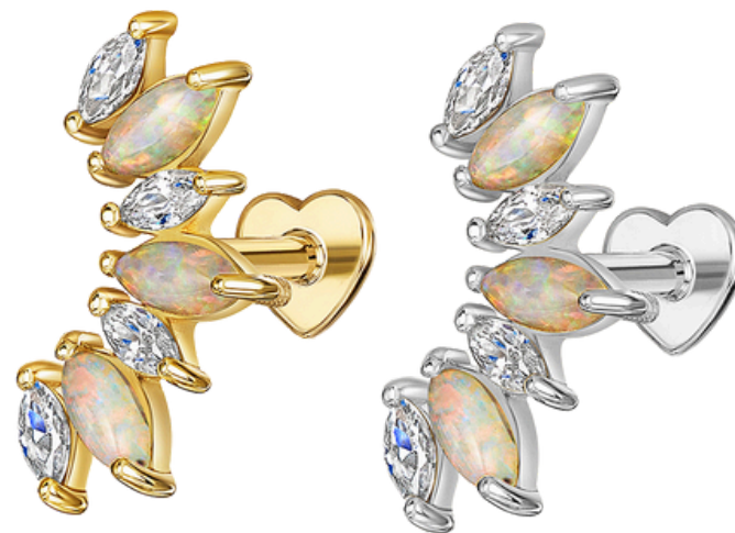
Titania's Crown stud, £220