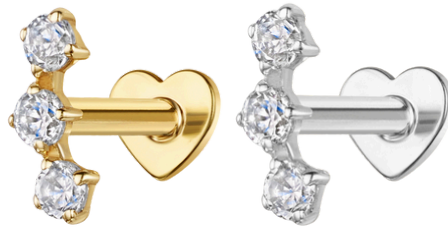
Trinity crystal stud, £140