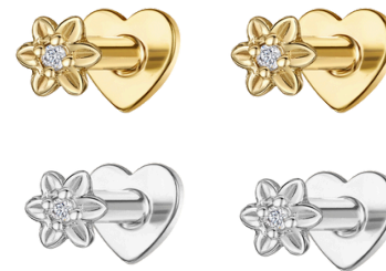
2 x 14k solid 'Forget Me Not' tiny flower flat back labret studs