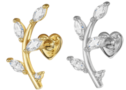
Vine garland stud, £170