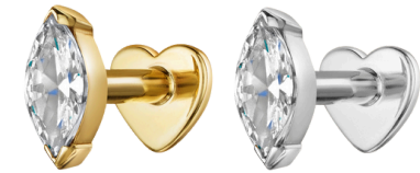
Marquise stud, £120