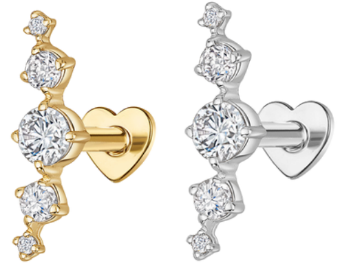
Astraea stud, £180