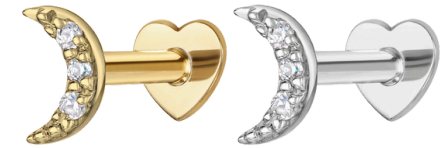
Crystal moon stud, £120