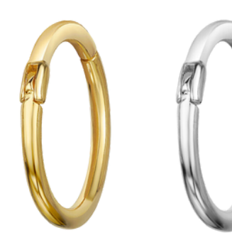
Plain clicker hoop, £150

Sold as singles All available in 14k solid yellow or white gold