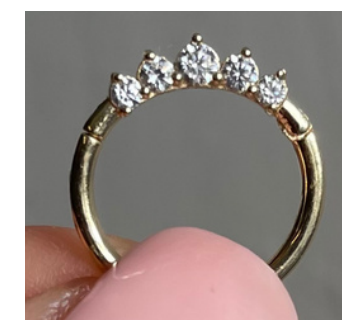
Tiara clicker hoop, £220