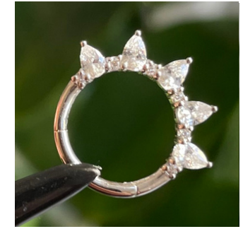
Dreamer pear cut clicker hoop, £220