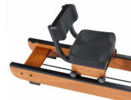
SEAT BACK KIT