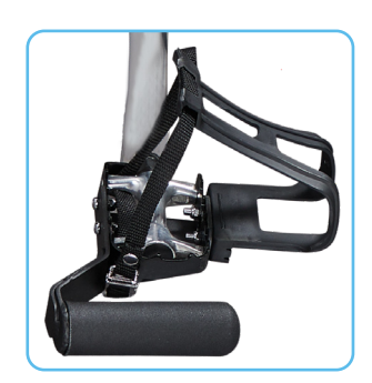
COMBO CYCLE PEDALS AND HAND GRIPS