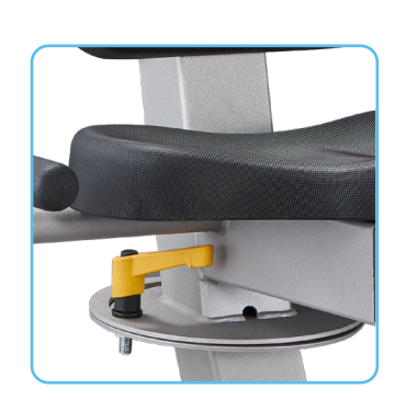
ROTATING SEAT HANDLE