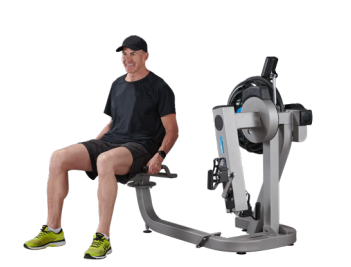
ROTATING SEAT FOR ENTRY AND EXIT

The E750 provides options to engage virtually every muscle group, targets strength, builds endurance, rebuilds stability, flexibility and balance.