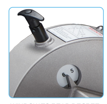
WINDOW TO READ DEGREE OF ARM ROTATION