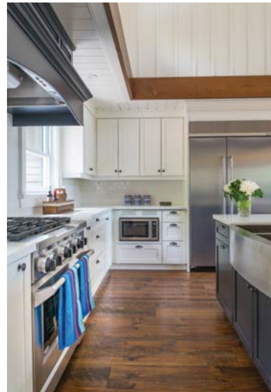
RIGHT: A dinner table of reclaimed elm sits on pine salvaged from a barn in Quebec. BELOW: Plenty of natural light illuminates the kitchen.