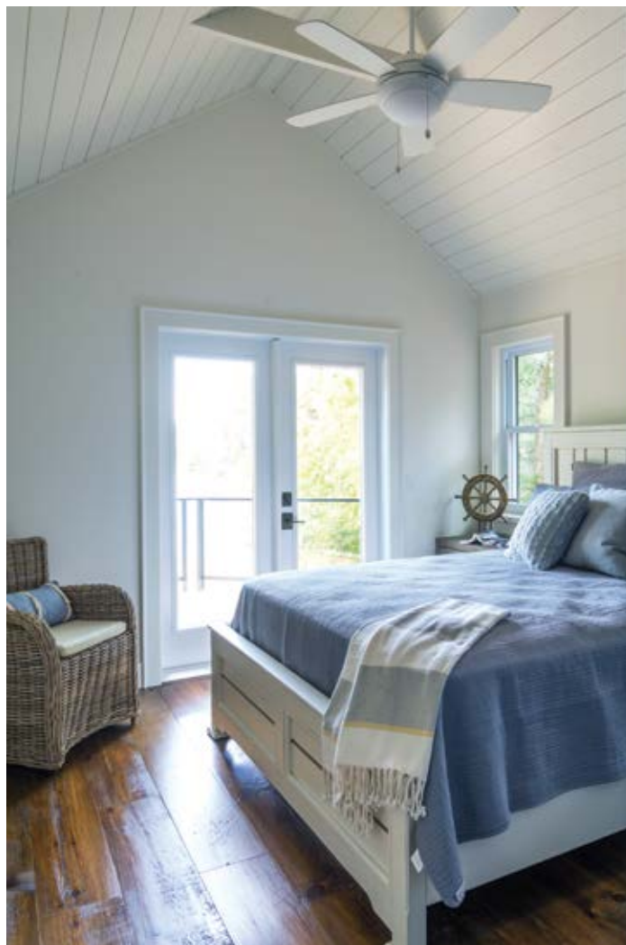
Darcy Sheppard built sliding barn doors for spots such as the en suite shown in the photo, right. Doors in this bedroom open to the deck at the front of the house.