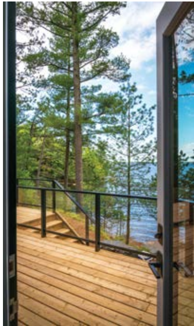
RIGHT: The great outdoors is ever-present at this cottage. FAR RIGHT: Shaker-style cabinets furnish the bathrooms, kitchen and dining room. BELOW: Horizontal windows over the bed brighten the master bedroom.