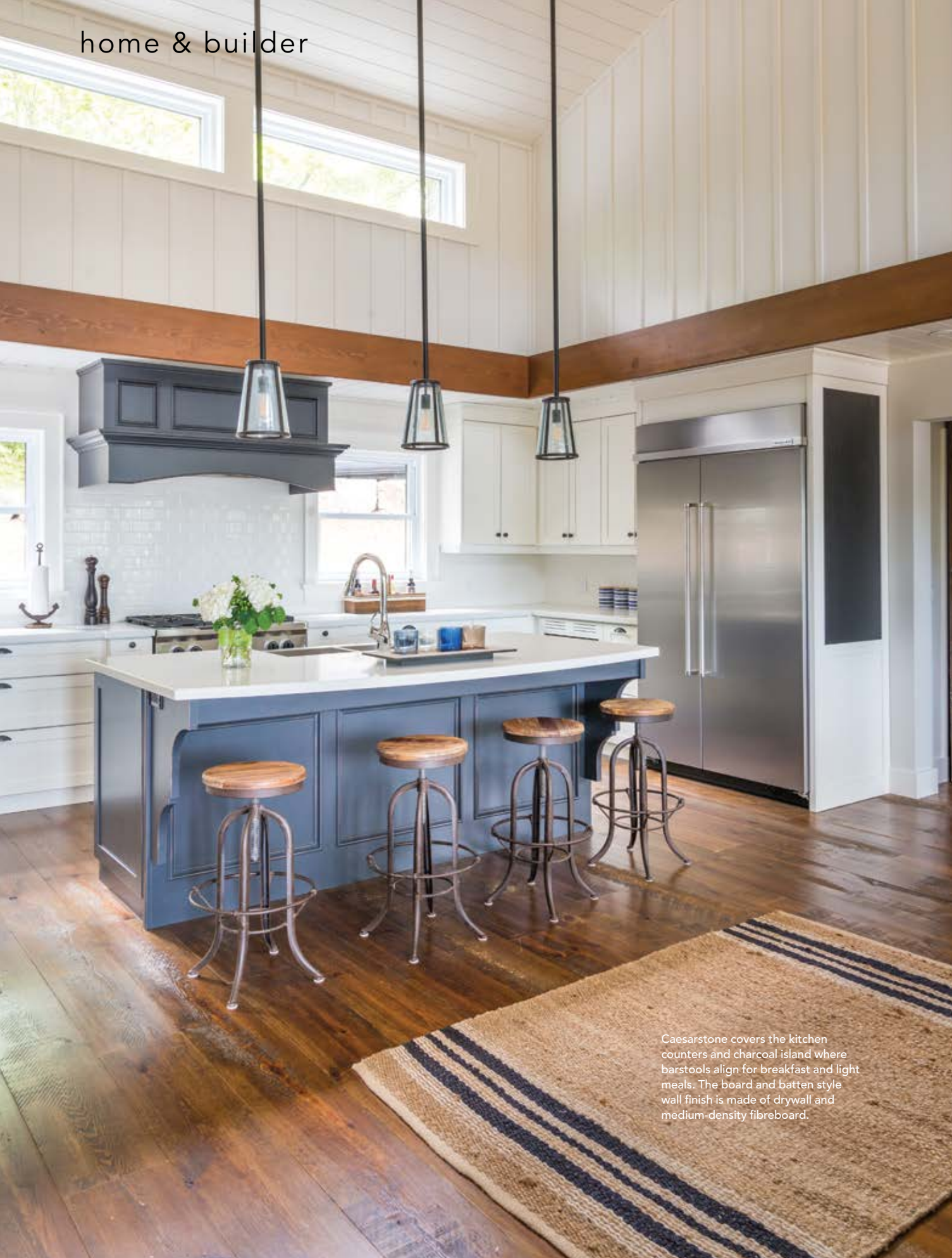
Caesarstone covers the kitchen counters and charcoal island where barstools align for breakfast and light meals. The board and batten style wall finish is made of drywall and medium-density fibreboard.