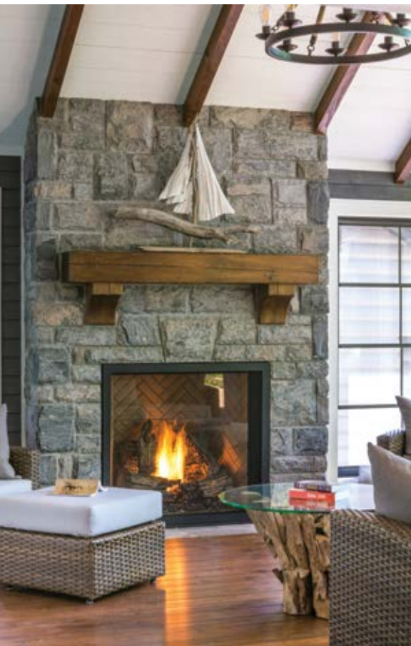
ABOVE: Cedar shake walls, cedar flooring and fir beams create a country look in the Muskoka room. LEFT: A stylized sailboat graces the mantel. OPPOSITE, TOP: The living room in a tiny, comfy cottage at the front of the property provides guests with a lake view. BOTTOM LEFT: Two bunkies hold additional private sleeping space for overnight visitors. BOTTOM RIGHT: A high vaulted ceiling and large windows in the living room make sunsets a spectacular sight.