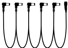
CABLE-5-LEAD RIGHT ANGLE DAISY CHAIN INCLUDED IN PA-9ECB BASIC KIT