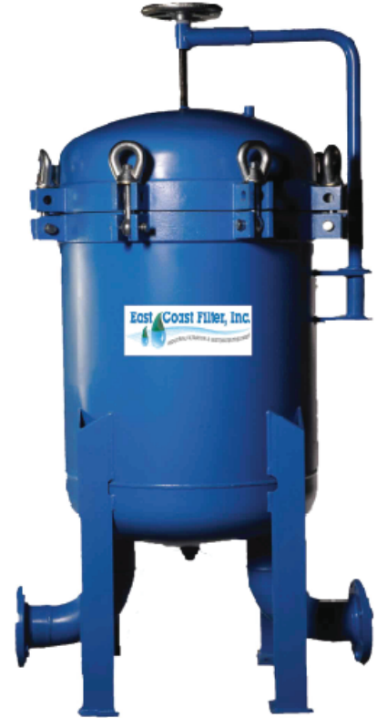
6 Round Bag Filter Vessel in Carbon Steel