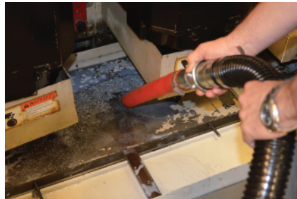
Vacuuming Up Chips