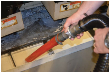
Removing/Filtering Used Coolant

Flexible Crevice Tool, Extension Tube, Crevice Tube with Angle head, Floor Suction squeegee for cleaning up spills, Suction Hose (10ft), and Discharge Hose (10ft) with trigger actuated nozzle.