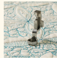
HIGH SHANK RULER FOOT SA218