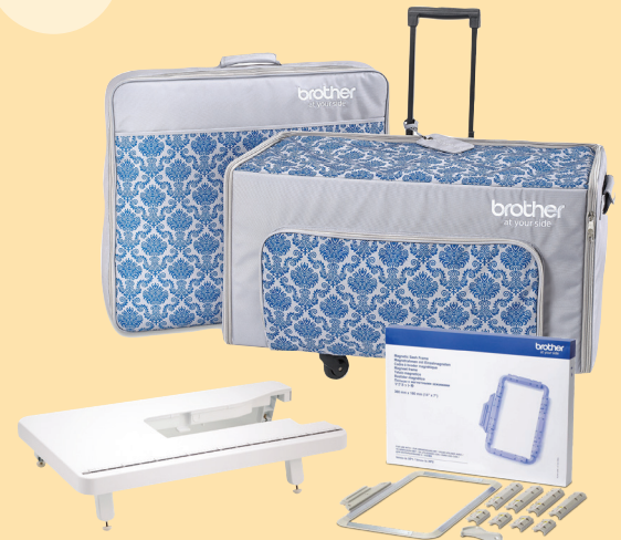
WIDE TABLE SAWTXP1C