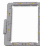
7" x 12" MAGNETIC FRAME SAMF300