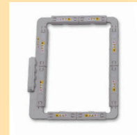
7" x 12" MAGNETIC FRAME SAMF300