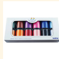
12-COLOUR EMBROIDERY THREAD SET SAETTS