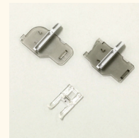
SPANISH HEMSTITCH FOOT SA220