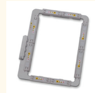
7" x 12" MAGNETIC FRAME SAMF300