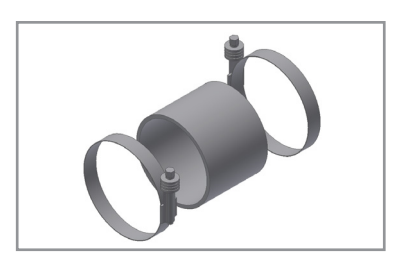
Hose and clamps kit (IK-3500H-01)