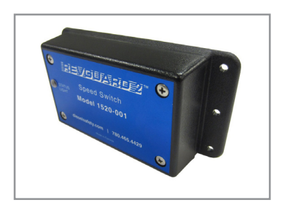
Revguard speed switch (1520-001)