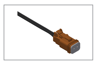
XT solenoid connector (RKS-XT-016) Fitted with 300 mm wires. One supplied with each XT valve.