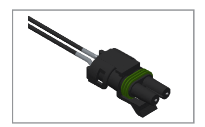
XT switch connector (RKS-XT-017) Fitted with 300 mm wires. One supplied with each switch version.